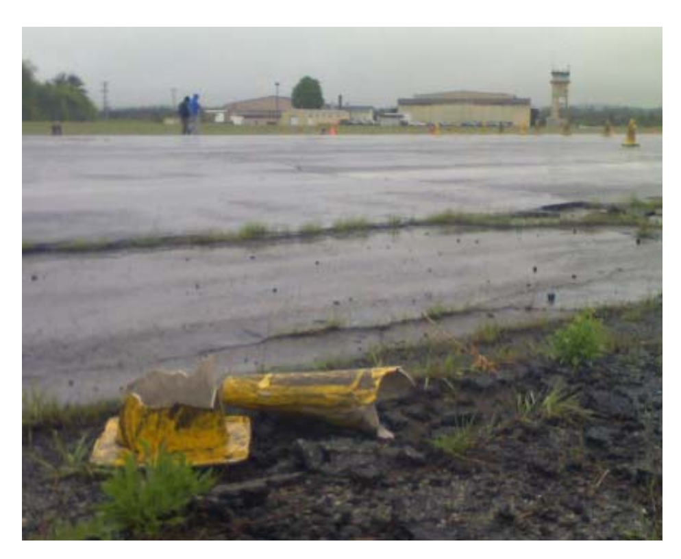
Slalom cone split in half during Phase 1 school Saturday

Phase 1 is appropriate for complete novices, but is also a good beginning-of-the-season refresher for those of us who can't autocross year-round. Most of the emphasis is on car placement and looking ahead, so there are no surprises while you're driving. The first three runs of the day are timed, then compared with the last three runs of the day.