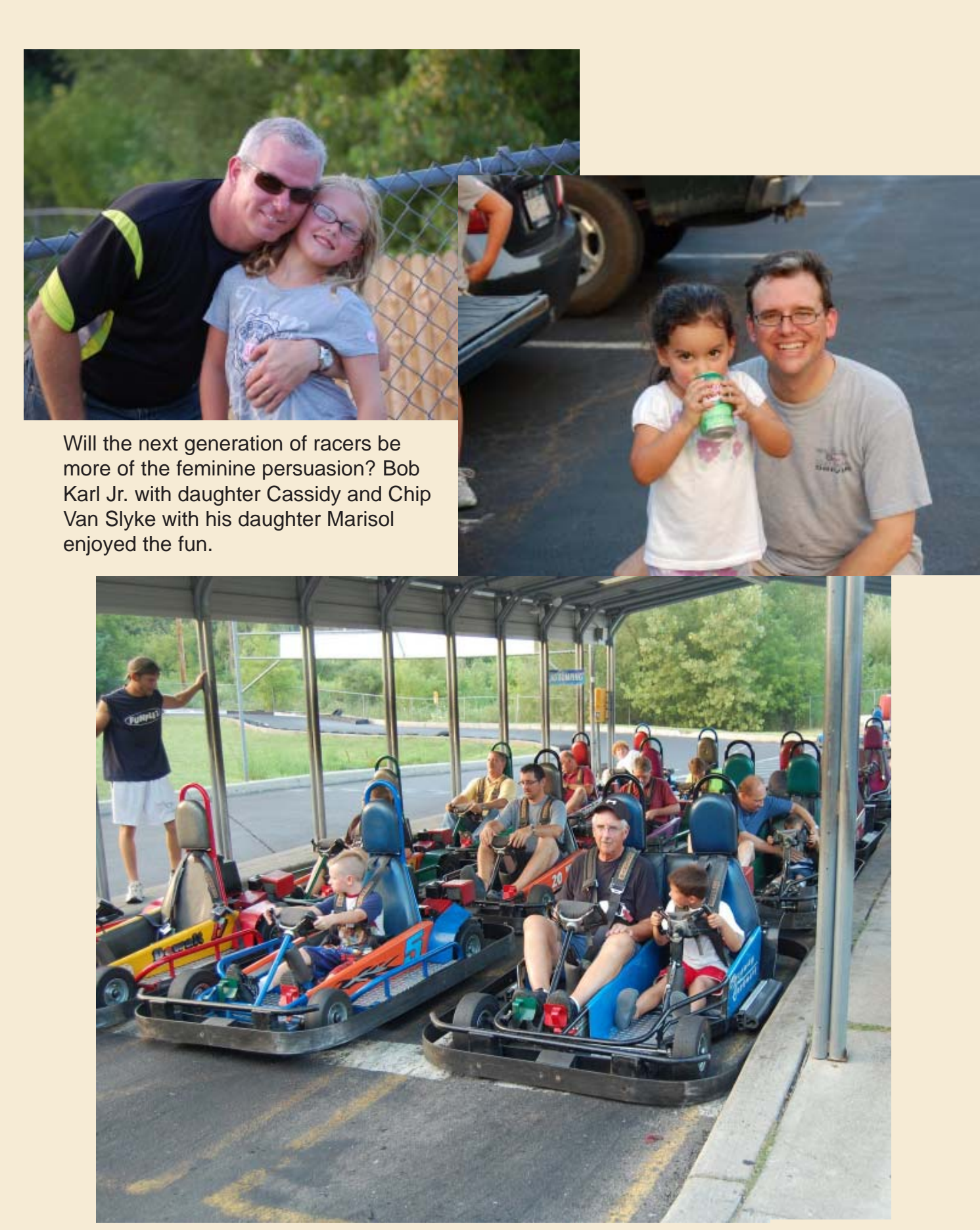
Let the games begin!