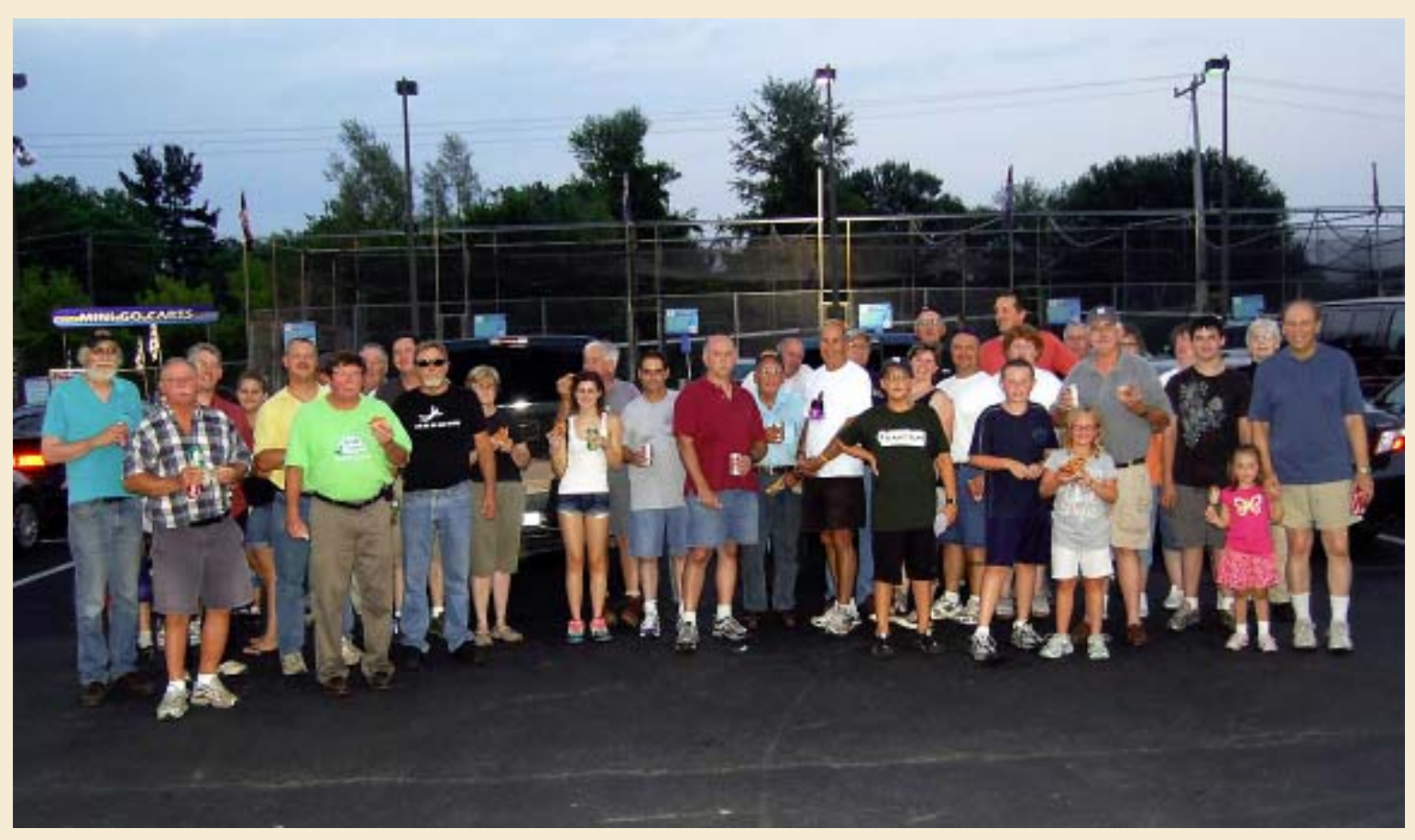
Hail, hail, the gang's all here!