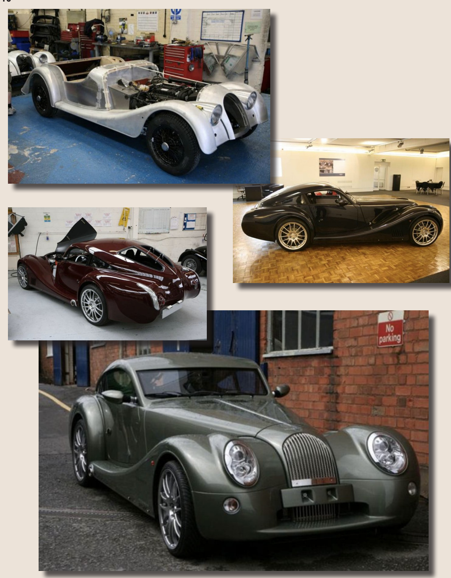
There are craftsmen.....and there are Craftsmen!!