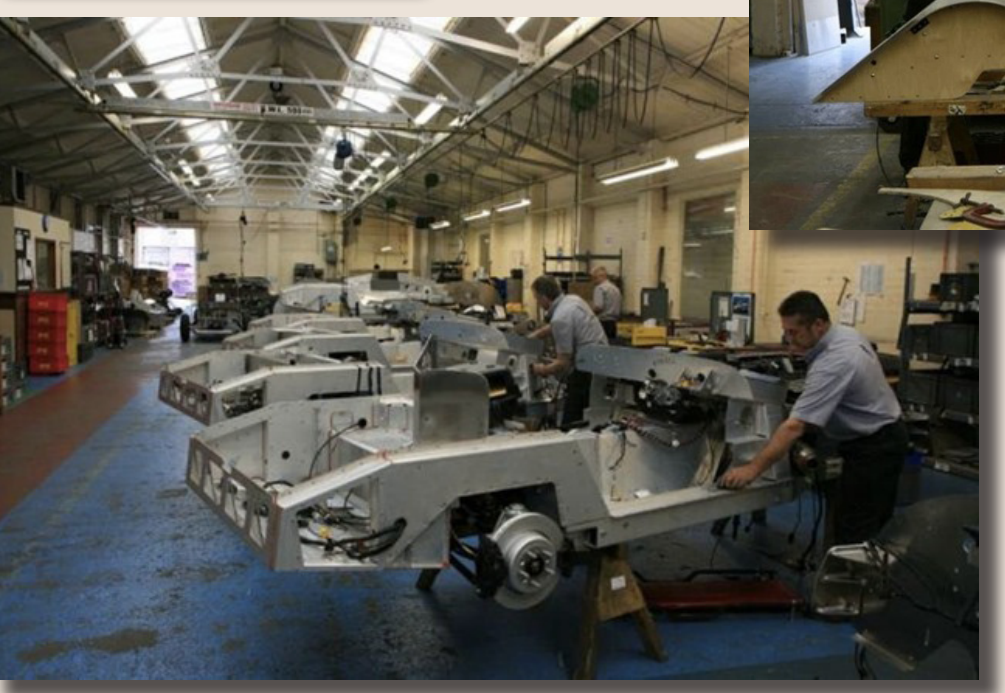
A Work in Progress.