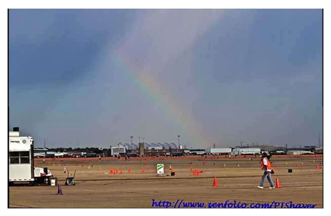
A zillion square feet of concrete

Nationals courses are the best youll see all year. They are long because of the size of this site which is something like a zillion square feet of concrete, more or less. And they are more challenging than a typical regional course. The designers are usually geniuses with IQs of about 192. Well, that's an exaggeration but they re smart anyway. So although you can memorize the course in a couple or three walks, it's best to take a few more in order to truly understand what the course wants you to do in order to go as fast as you can. Given most driver's limited skills (let's see those hands go up ... Will you can put yours down) the extra walks are a good idea. Try to pace yourself and take a long break for lunch. Talk to friends from back home and also to those you see only once a year at Nationals. Walk, rest, hang out, walk some more. Go back to the hotel and take another nap. By the time Will and I were done walking it was getting dark and we were hungry and tired from miles of hiking both courses.