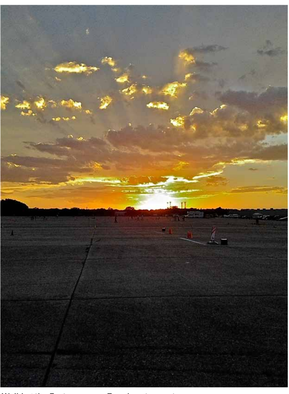
Walking the East course on Tuesday at sunset

So we put the car away and walked the East course after the end of the day. We were lucky and got to see a beautiful sunset.