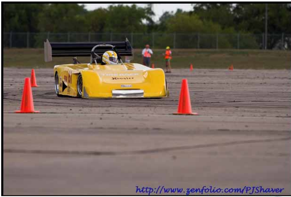
The Cheetah in action at the Nationals

In the first corner of my first run the rear end of the car moved a good bit for the first time since I've owned it. This was a pleasant surprise. It took a few corners before the car proved that it was now closer to neutral than it had ever been. When I pulled back into grid I told Will that the car was good and to go hard.