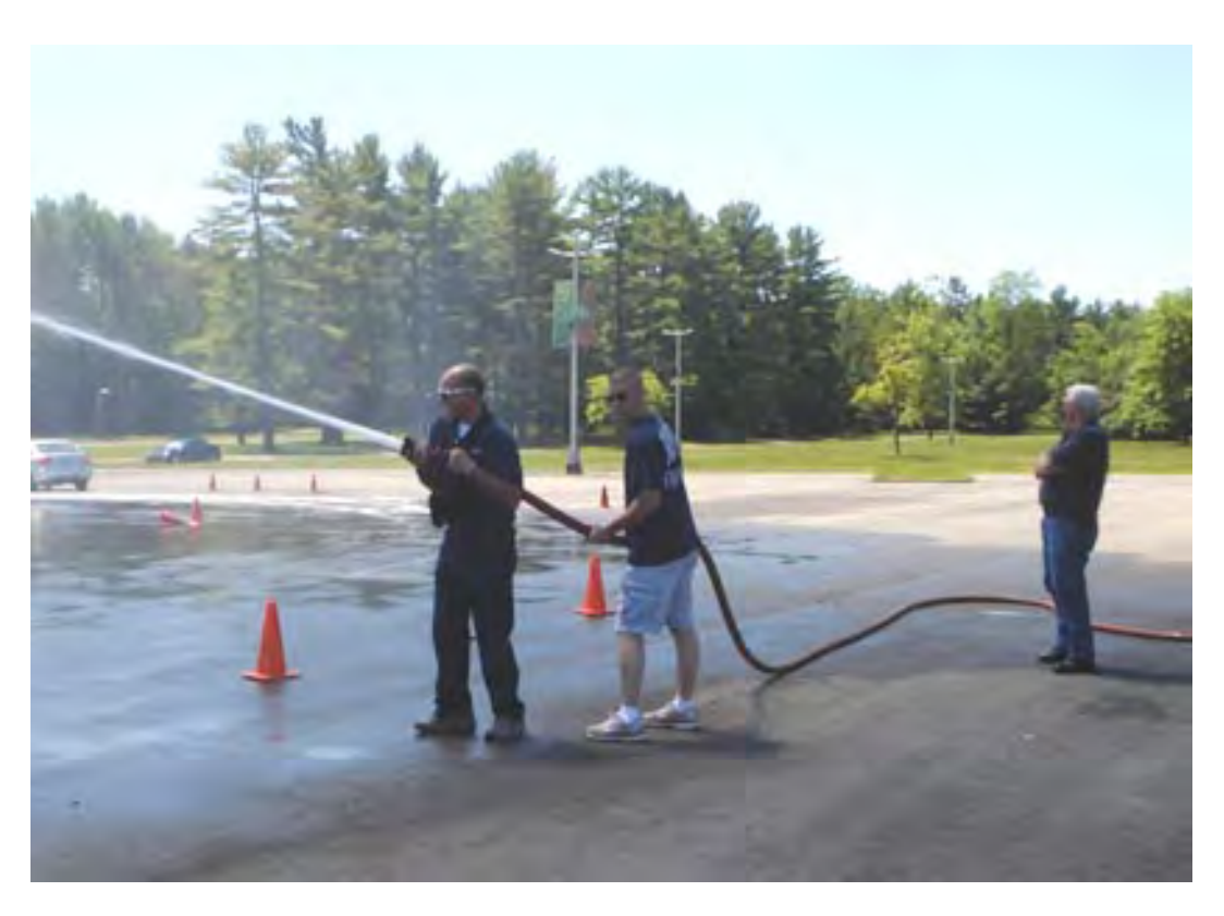
The volunteers from Milton FD keeping the skid pad wet for us