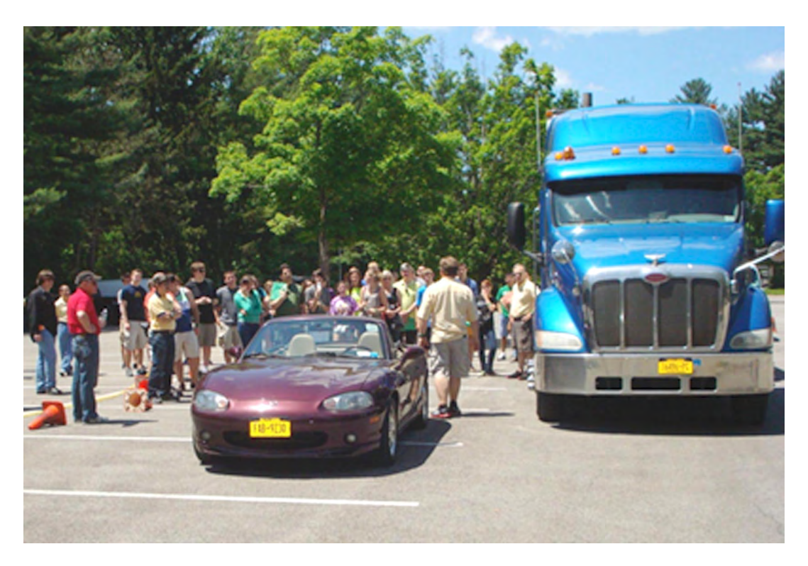
The tractor trailer demonstration