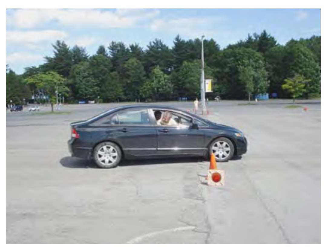
Hmm, how many cones did we take with us?