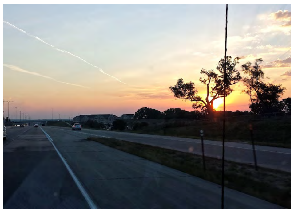
Early morning departure from Lincoln

And so while the competition side of my trip to Nebraska was less than stellar, I was nevertheless able to go home happy and with gratification. See. You never know what will come from a trip to the National Championships.