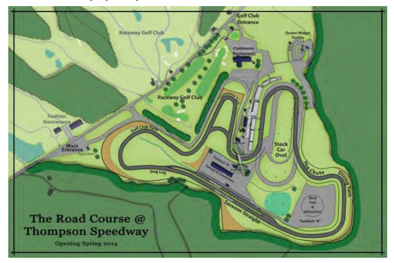
The Proposed Track Layout At Thompson Speedway Motorsports Park

For the Thompson Speedway Motorsports Park it is "back to the future" for now. The existing oval track is going to be removed and a new purpose-built road course is going to be constructed. The proposed plan for the track is shown below: