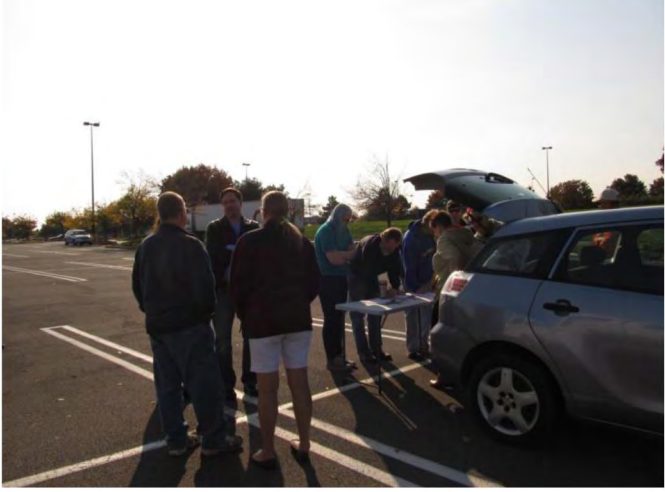
The crowd at registration