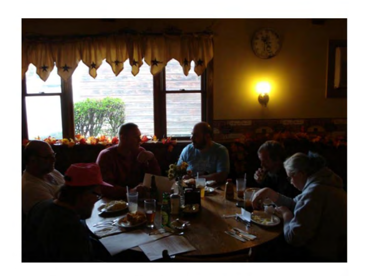
Post-rally meal and socializing