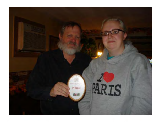
Mileage winners Team FooBar