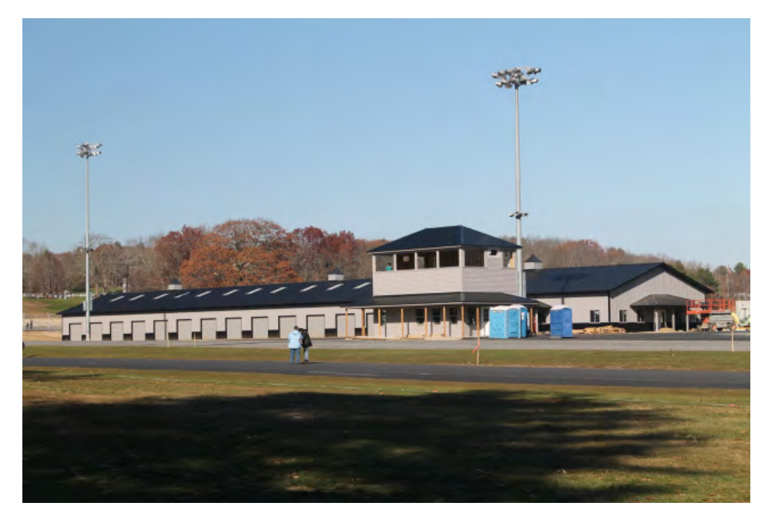
The Control Tower With The New Garage And Classrooms In The Background

built, as well as the control tower is nearing completion, therefore we were able to get a good idea of the configuration of the track during our tour.