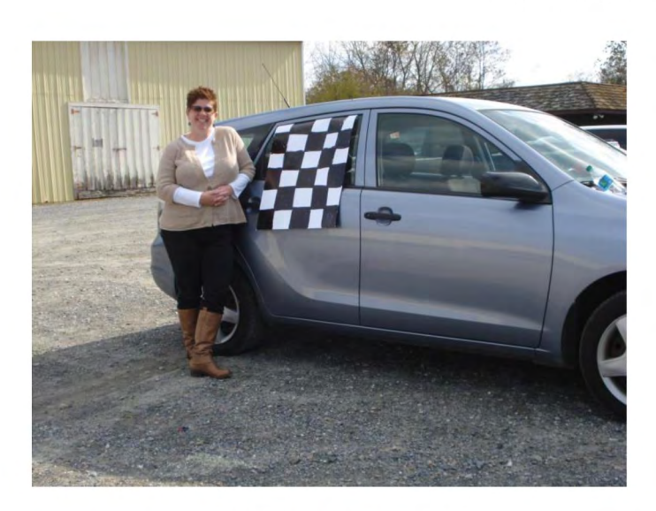
Waiting at the finish line