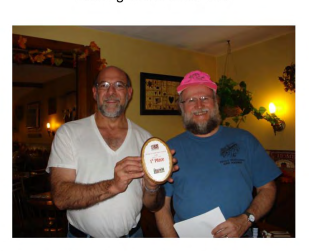
Team Paradise with their custom-made 1st place trophy