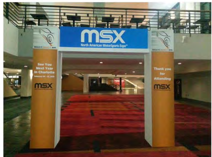
Welcome inside the convention center