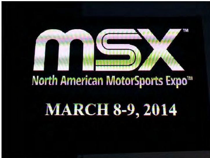
Electronic sign outside the convention center