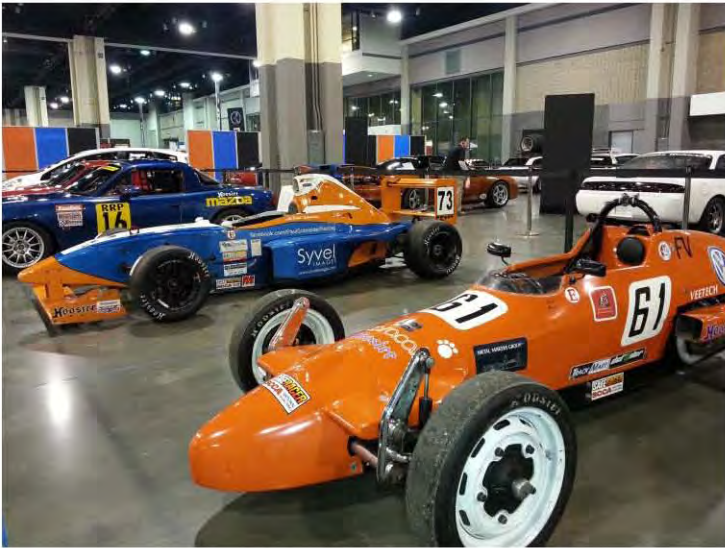
Convention floor cars on display