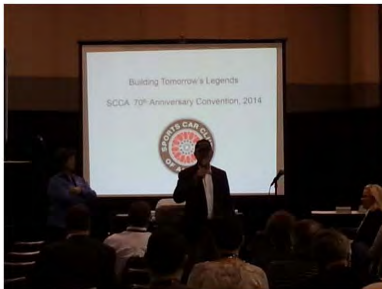
SCCA Hall of Fame inductee Bob Bondurant telling stories during the "Legends" session