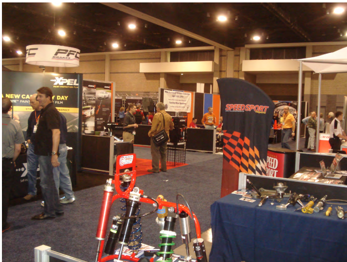
Exhibitors at MSX