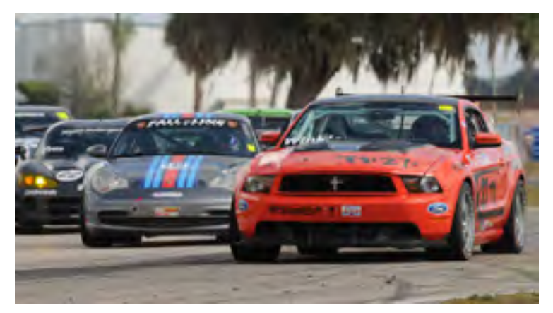
The 2015 Majors schedule includes a traditional January stop at Sebring.

TOPEKA, Kan. (Sept. 18, 2014) – The calendar for the 2015 SCCA U.S. Majors Tour was released today, with an announcement that the country will be divided into five Conferences for the 2015