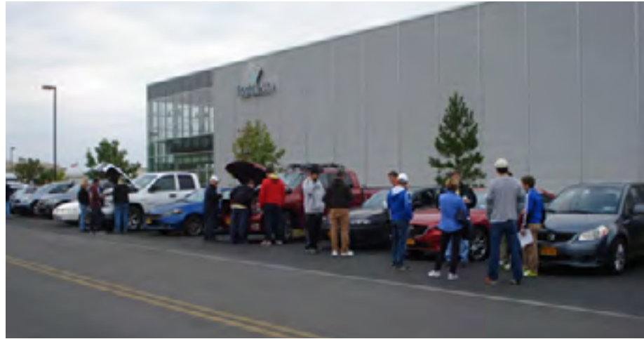
Instructors greeting their students during morning tech inspection