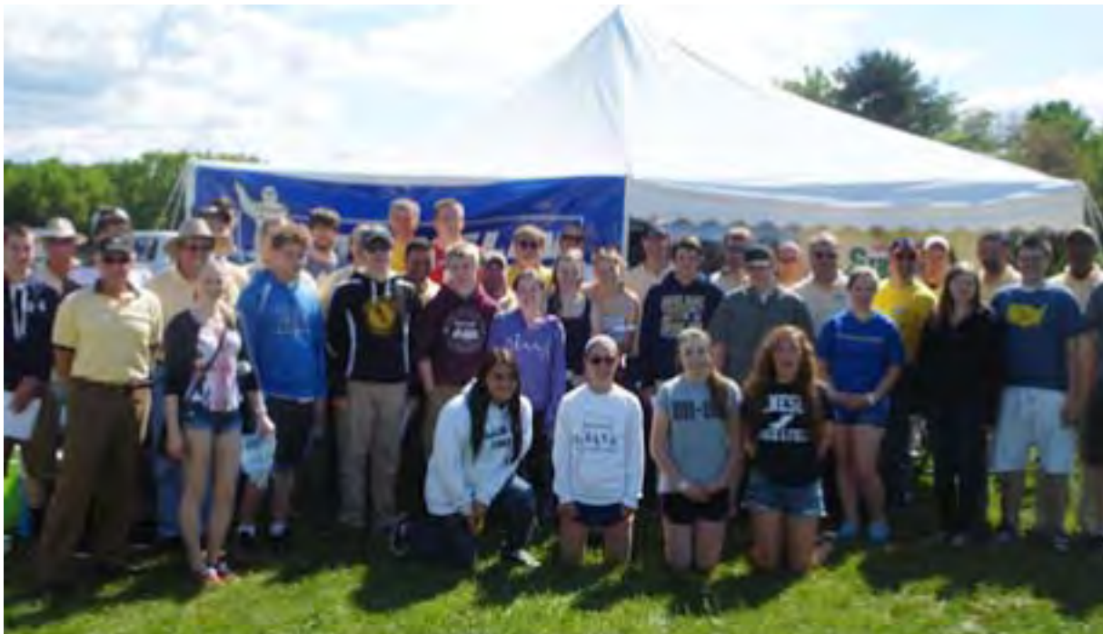
May 2014 students and instructors