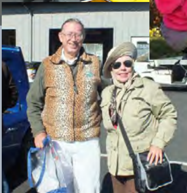
These MoHud members were at the John Stim Memorial Race at Thompson and a solo event at the McCarty Avenue lot.