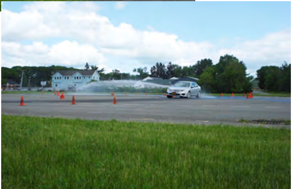
Getting loose on the skid pad