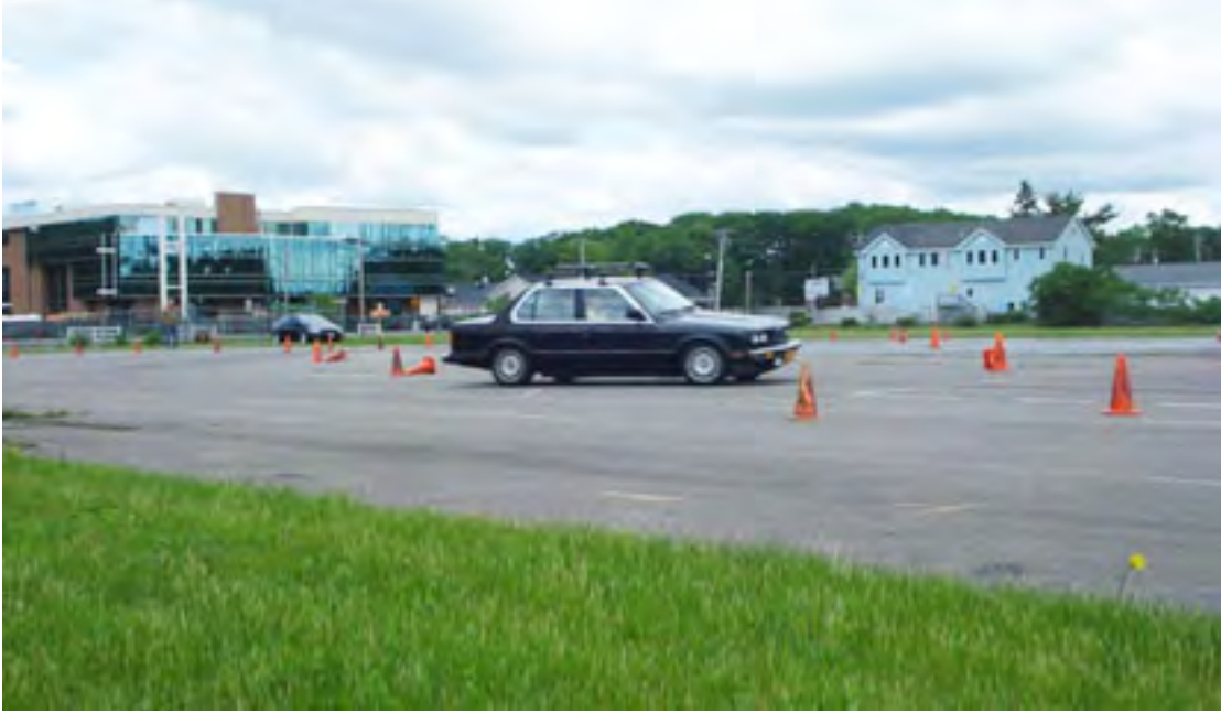
One of the many BMWs making its way through the course