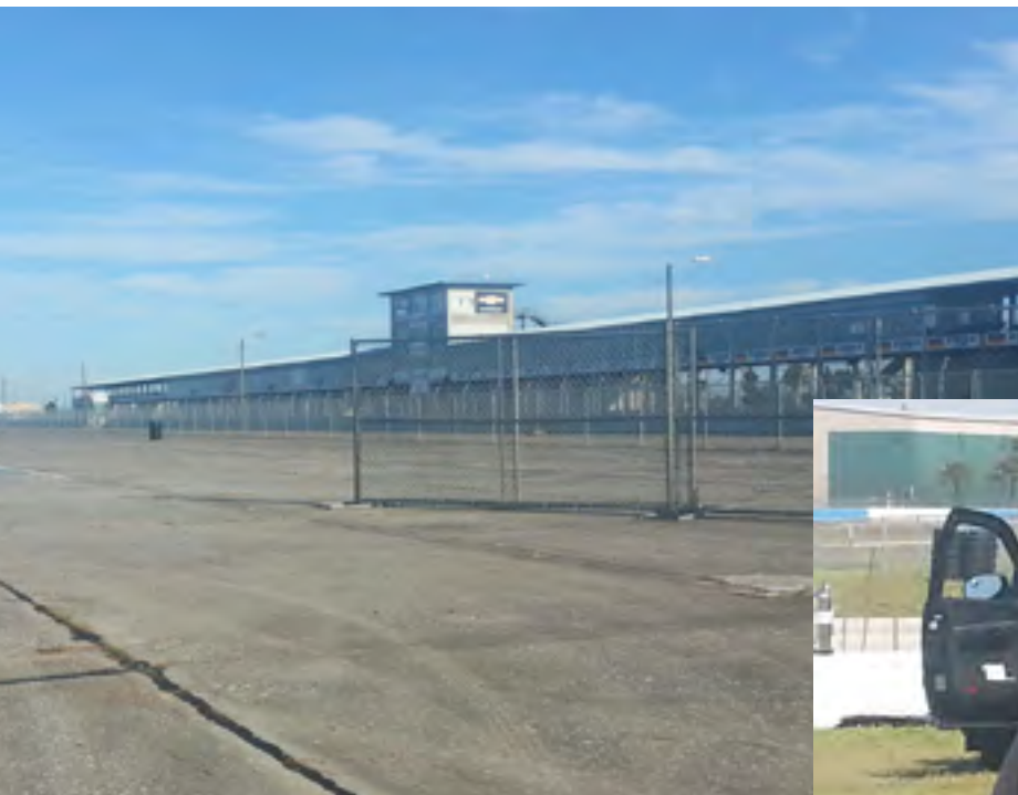
The tower at Sebring