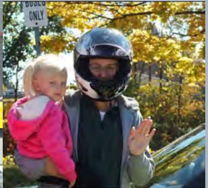
The Burckhard Girls