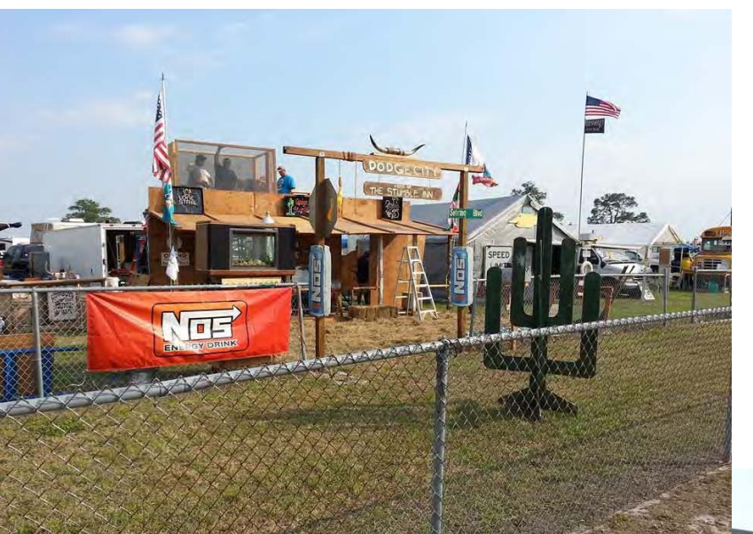
They bring the Wild West to the race, complete with chickens.

the end of the race day - the same adult beverages they'd been making available to themselves for most of the day and over the course of the four days of racing.