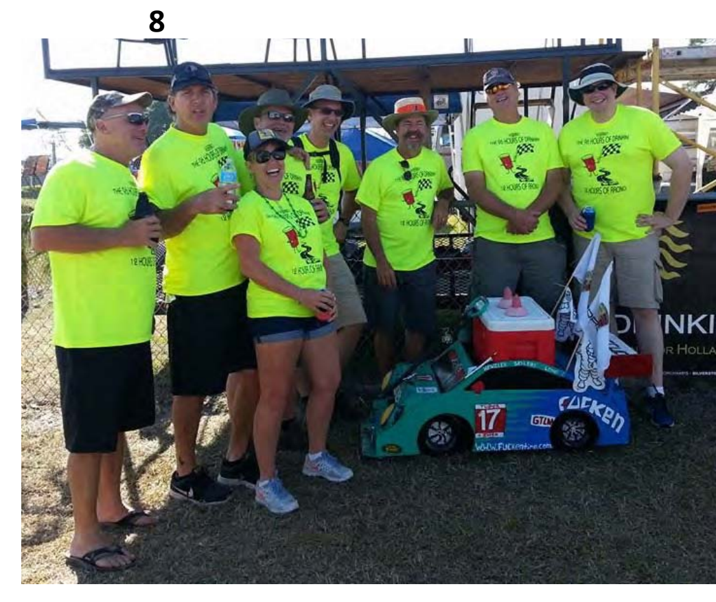
The "96 Hours of Drinking" team, complete with replica Falken Tire Porsche 911 GT race cooler.

left from wheel in the incident, yet got itself turned around with some massive throttle inputs, but in the grass on driver's right. He attempted to re-enter the race surface, not realizing he was missing his wheel and suspension, but a quick signal from me using the universal hand drawn across my throat several times indicated to the driver he should shut it down.