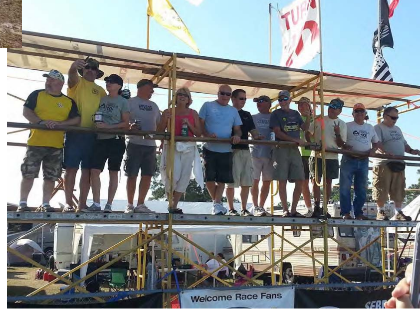
The good folks of Turn 10. They erect the scaffolding.

As a "Fuh-new-gee" (you can probably figure that one out yourself), I was introduced to the Turn 10 fans and given some mild hazing. I had to stand in front of the Turn 10 fans and loudly proclaim "I LOVE PEANUT BUTTER!" - not understanding why at first, until I heard the fans' response. Again, decorum prevents me from adding the other parts that surround that phrase, but it was all in good fun.