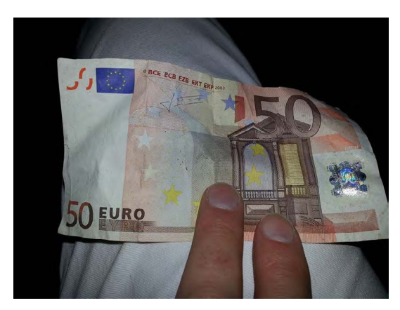
Sometimes it pays to walk the track before the race day begins.

Saturday was the big day for the 12 hour race. Racing got underway around 10:30am, and continued right up until the ending fireworks at 10:40pm Saturday night. We had a total of 11 flaggers for our three turns, which we turned into four teams of two flaggers, with the three corner captains - Rich, Mack, and Dave Hsu of DC Region, acting as