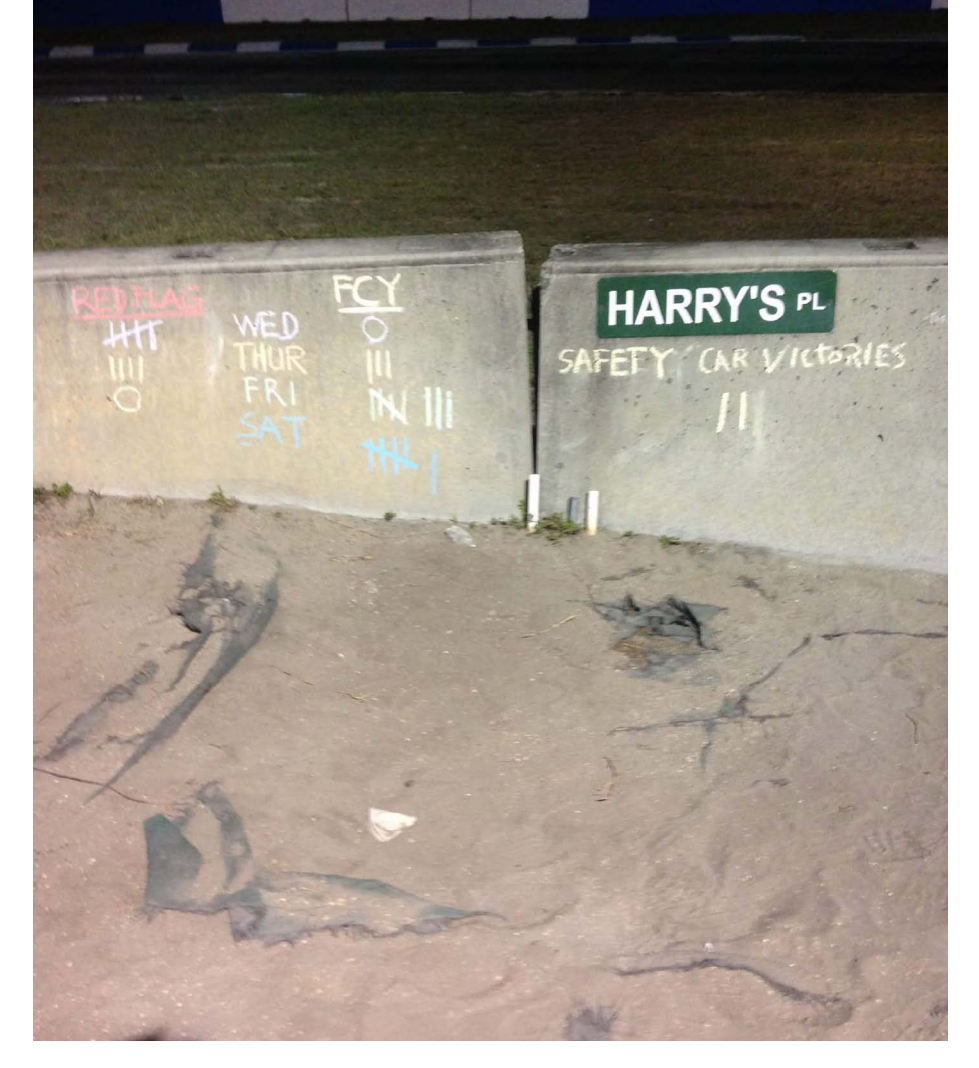
Flaggers track the Full Course Yellows for the event, as well as "Pace Car Victories" (races ended under cautions)

responsible for initiating the changing of the teams each hour. It worked well, and we were able to stay pretty fresh for the entire race. My big moment came when the #31 Whelen Daytona Prototype finally lost it's right front wheel after making the turn at 10. The loose wheel came gently rolling by us along the wall, and we watched it come to rest about 40 feet down from our station. When I watched the incident on TV. I can see me holding the full course yellow flags as the wheel goes by, but no one would have recognized me from the distance the camera showed it. Central Florida Region did a pretty good job of delivering food and drinks to us during the race. During the race. I noticed fans