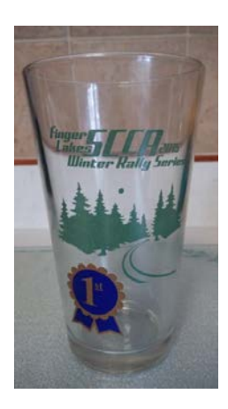
First place trophy