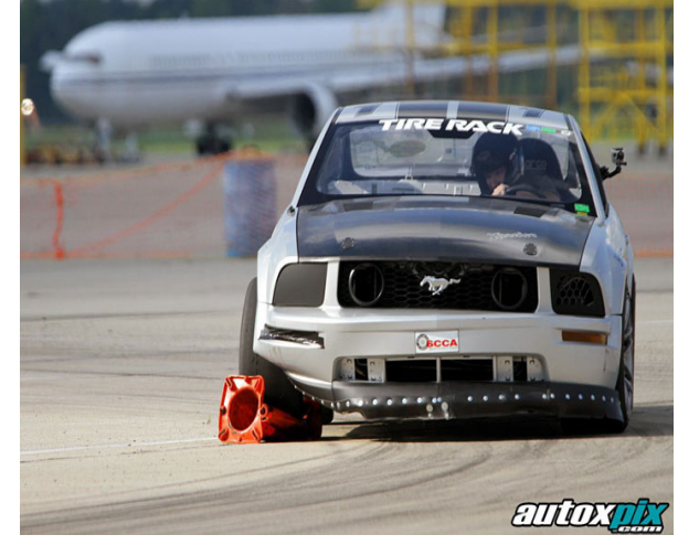
A cone becomes a casualty at the Tire Rack SCCA Wilmington (Ohio)

The meet utilized a similar format as the National Championships, which allowed each driver to