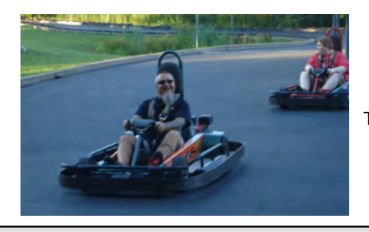
The family that races together stays together