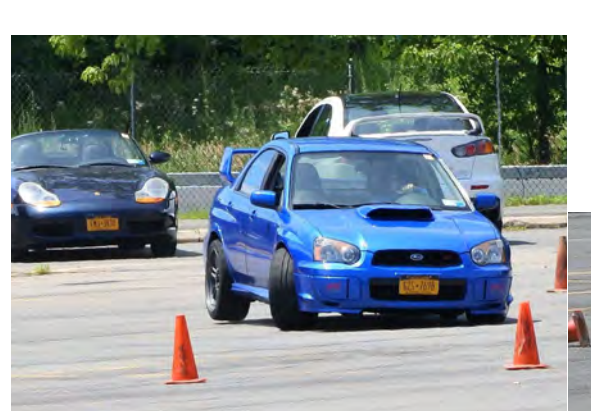
At the moment, he's not thinking about tires...

(Is this a bad time to mention that New Jersey warehouse where they staged the Moon landings?)