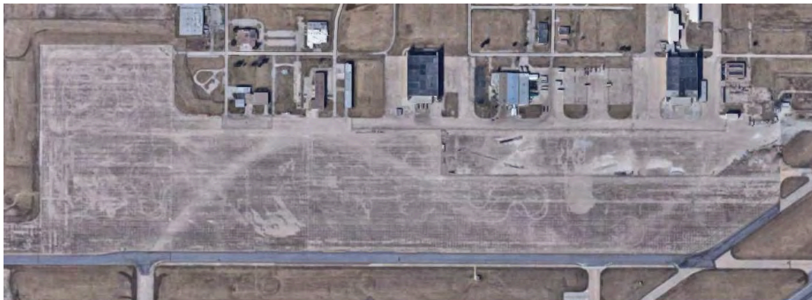
Course Map (!)

While ghost trails from previous Solo competitions can be seen from above, the site is a blank canvas to competitors, with the exception of paddock and grid areas for the East and West courses, diagrammed on the SCCA website.