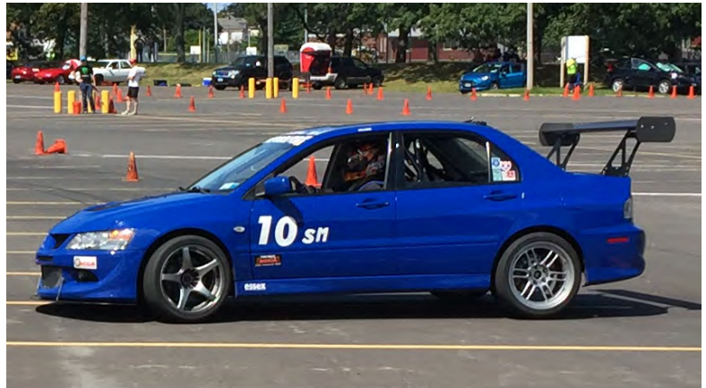
Perhaps We Can Coax EJ to do a "Ted Talk" at Next Meeting on the Subject of New Mods to #10