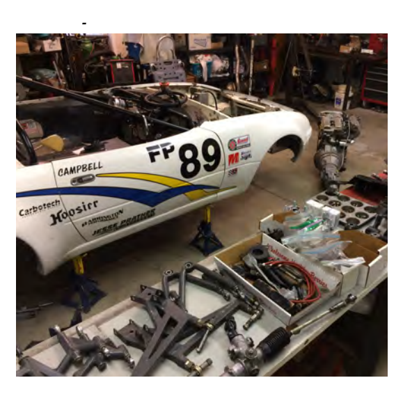
Campbell Miata Kicks Off Its Shoes