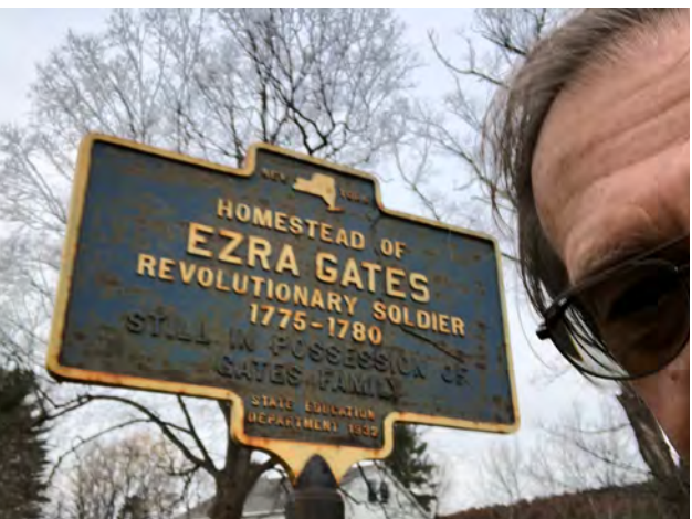
Drove to a rally checkpoint, then took a selfie for proof.