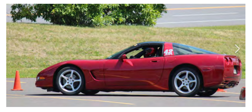
Chuck at Speed

Chuck continues: "A web based magazine that is quite helpful in solo and club racing is http://www.racershq.com/, it is a collection of podcasts and articles from stunt driver to veteran F1 drivers giving input on how to not only be a better driver but also gain sponsorships and all aspects of being a performance driver. RacersHQ was a huge help in putting me on the right track to gaining sponsorships and growing as a driver. I think a lot of MoHud'rs could find the site useful."