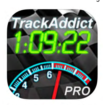
+ This app is designed for both iPhone and iPad

TrackAddict Pro is available for iOS devices through the Apple AppStore, and for Android via GooglePlay. As OBDII outlets have been mandatory on since 1996, use of that port is dependent on its placement in your vehicle; most manufacturers now put the port near/underneath the steering wheel.