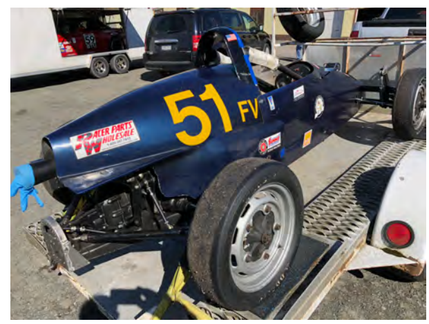
Ron Bass' Formula V also seems to have been inspected by TSA