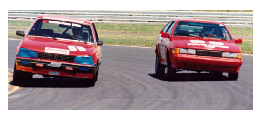
Buckle in! Fire up! Get on the course! A new season is just beginning...