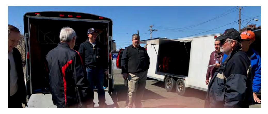
2018 racers discuss the 2019 class changes (see the April 1st KO)