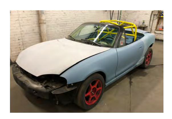
Forget that stork story; this is how race cars are born