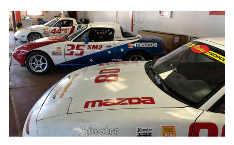
Eenie, meenie, moe, three Miatas in a row