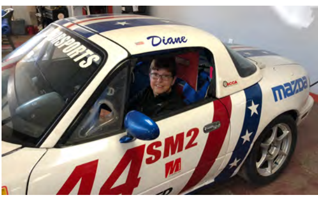
Old race cars never die they just get new drivers