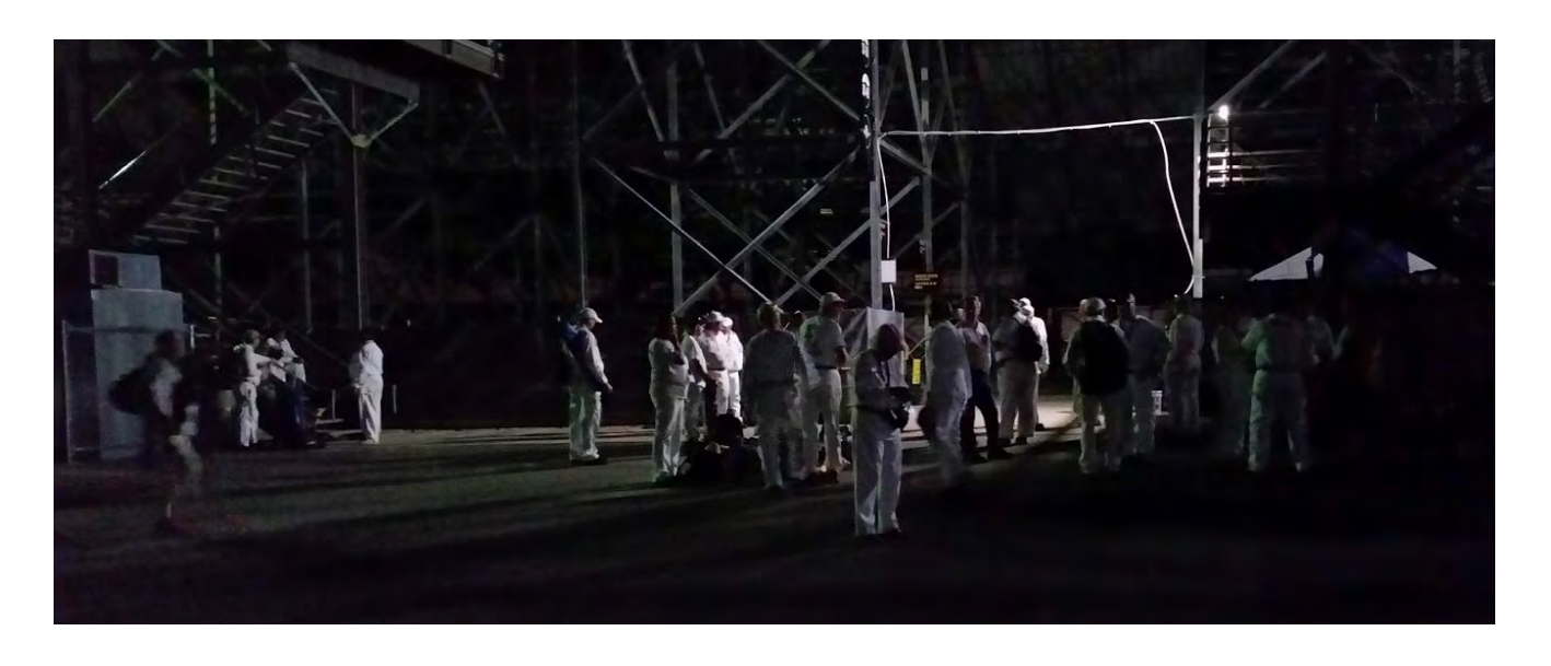
Monday, start of the Runoffs: Flagger meetings sometimes happen at Oh-dark-thirty, or maybe it was 6:30am.