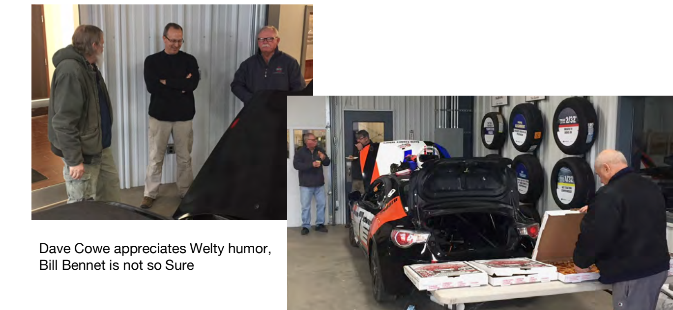
Pizza is teched according to Appendix P of the GCR