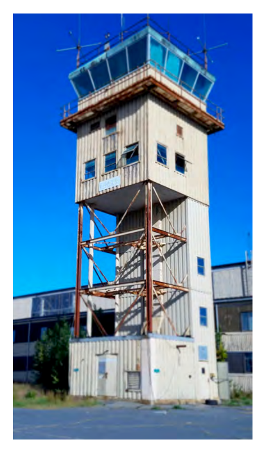
The Tower at Devins

Attempts to improve the cooling system would continue into July and then August. And just as frustrating was the intermittent electrical problem of the past few years. Despite the presence of the alternator, the battery often drains during the course of an event. Making matters worse, the paddle shifter uses a big blast of amps with every shift. If there is low voltage, the driver can experience a non-shift.