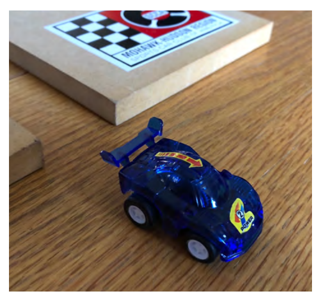
MoHud Spec Racer Leaving the Chute

Stewards of the event were pleased with the new, sophisticated, laser-directed scoring system and the general organization of the competition. However, they are looking at tweaks to the starting procedure, and will be investigating a different, straighter-running, spec car for 2019.