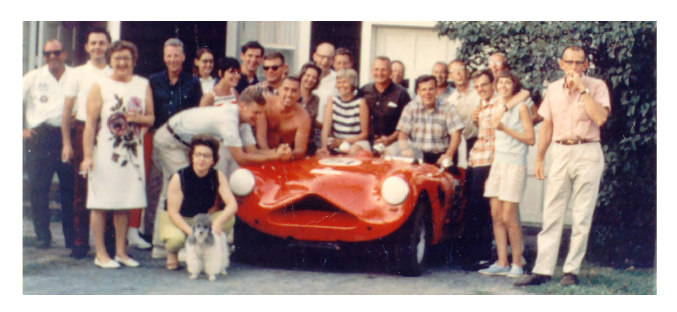
Turnout for an Early FotF Annual Tea