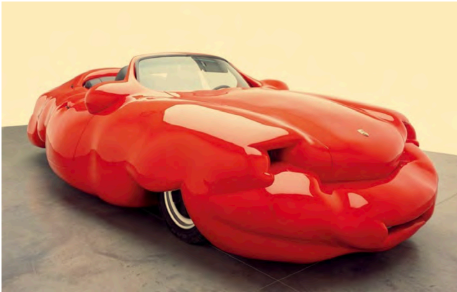
Devils Food Porsche Team 1