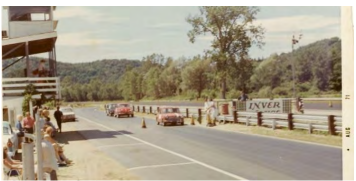
It was a standing start from Lime Rock's pit lane for the timed laps. It looks quite different these days

Saturday August 16 1969 started rainy and gloomy as I got on the Thruway at exit 24 and headed south. For a summer weekend morning there seemed to be much more than the usual traffic. As I made the switch onto the Berkshire Spur it struck me that there were an unusually large number of gaudily-painted VW MicroBuses headed in the opposite direction. As fate would have it they were all on their way to clog the