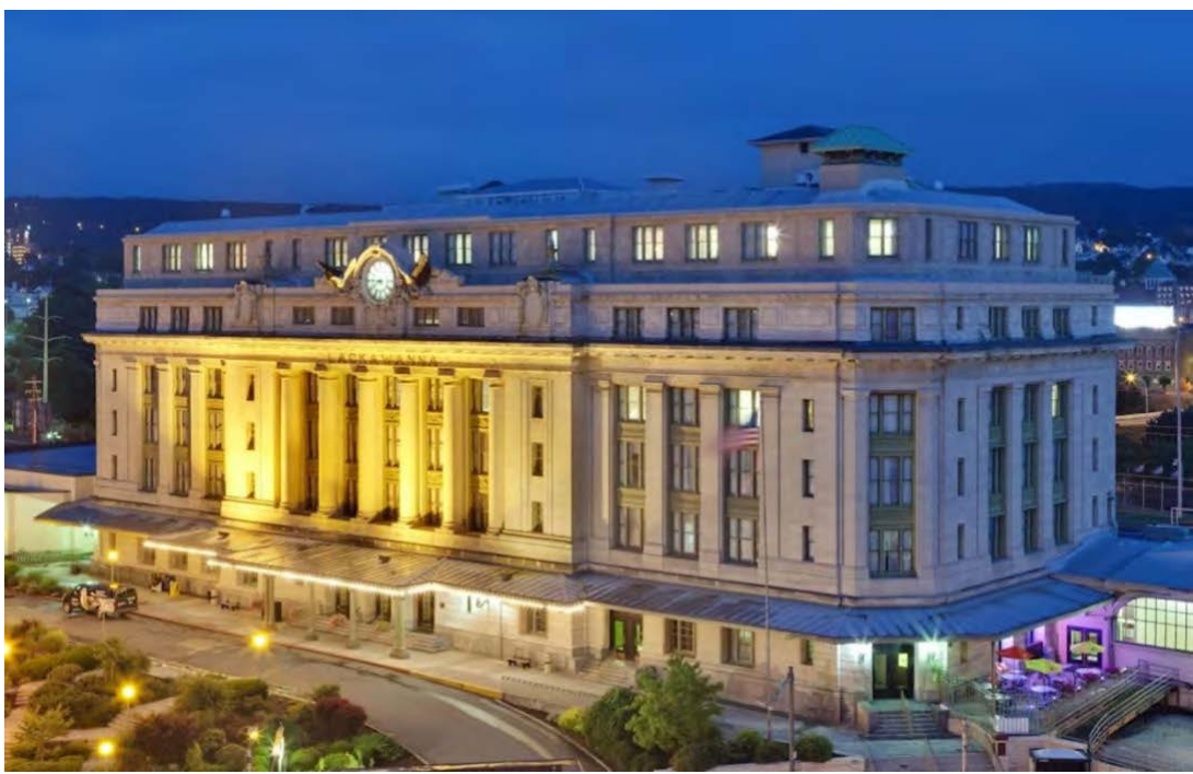
Radisson Lackawanna Station Hotel, Scranton PA