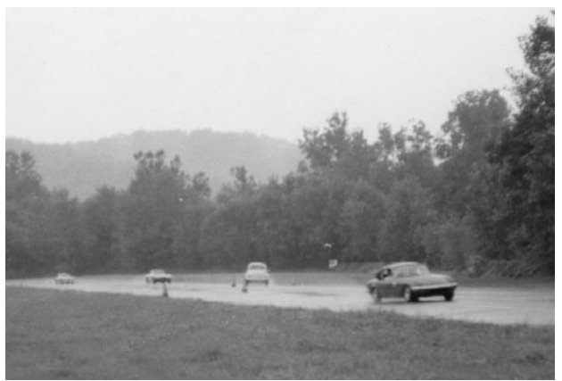
More familiarization laps in the rain at AUTOSPRINT #1 in 1969

even get to drive on a circuit that even that was legendary was a dream fulfilled.