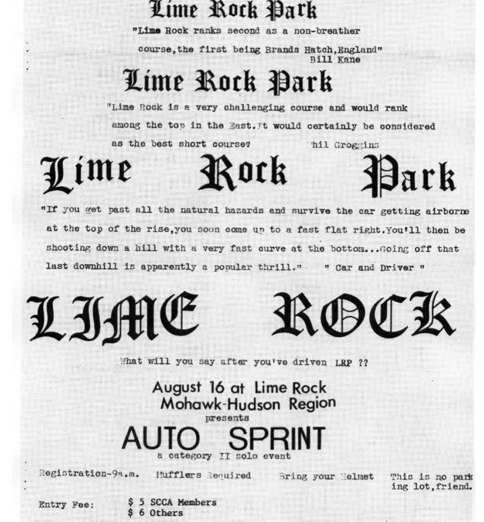
Official Knock-Off announcement for the inaugural (1969) AUTOSPRINT Entry fee for MoHud members was $5

speeds encountered in normal highway travel, but the course record at Lime Rock is over 100 mph, therefore you will find some pylons strategically located to slow you down. But there are fewer hazards at Lime Rock than you normally find around parking lots, so expect to move along fairly rapidly. Open to anyone with a valid driver's license. Cars must be equipped with mufflers and run quietly. Since this will be strictly enforced, you may have to leave your race car home and run the tow car instead. We need workers for this event also, but being a worker will not exclude you from running. Registration starts about 9 A.M.