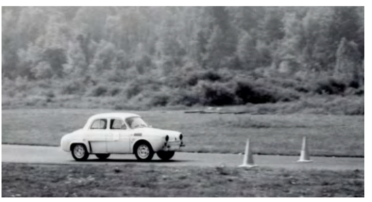
The author at the 1970 event driving his Renault 1093 into The Esses