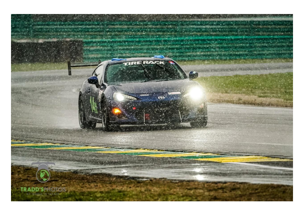
3 Time Trial in the snow? It happened at VIR.